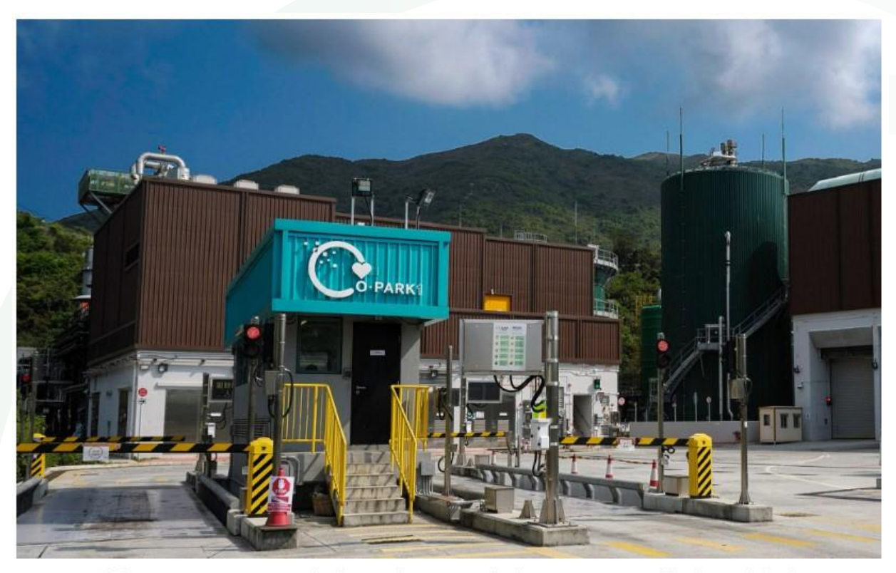
Hong Kong's first organic waste treatment facility, O Park, on Lantau Island, treats 200 tonnes of food waste daily.

The park's second phase, located at Sandy Ridge in the northern New Territories, is expected to be operational later in the year and has a daily capacity of 300 tonnes.