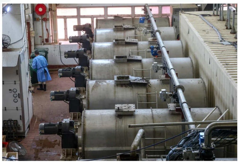
ad biofuel, faces closure in A

Government contract of BSF Hatch, which turns chicken faeces into animal feed, fertiliser and biofuel, is set to expire at the end of August