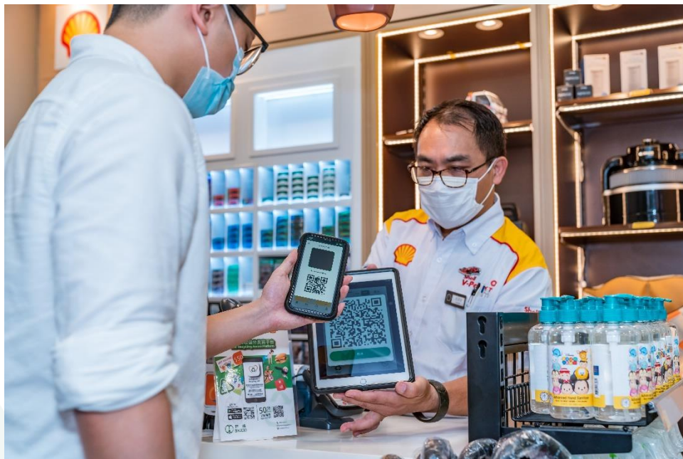
Users can earn bonus points by recycling plastics bottles (No. 1 and No. 2) and glass bottles at designated "iRecycle" collection points.